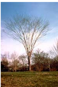
Compared to the American Elm (above right), it is readily apparent that the form and scale of this tree is really quite different, and

Reconstruction is defined as the act or process of depicting, by means of new construction, the form, features, and detailing of a non-surviving site, landscape, building, structure, or object for the purpose of replicating its appearance at a specific period of time and in its historic location.