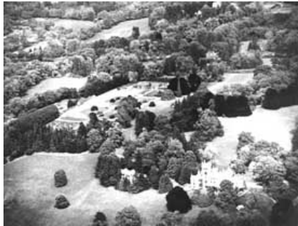
The landscape of Lyndhurst, Tarrytown, New York, is significant in American culture and work of a master gardener, Ferdinand Mangold.

It is during this step that the historic significance of the landscape component of a historic property and its integrity are determined. Historic significance is the recognized importance a property displays when it has been evaluated, including when it has been found to meet National Register Criteria. A landscape may have several areas of historical significance. An understanding of the landscape as a continuum through history is critical in assessing its cultural and historic value. In order for the landscape to have integrity, these character-defining features or qualities that contribute to its significance must be present.