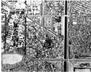
This present-day view of Rancho Los Alamitos shows present-day encroachments and adjacent developments that will affect the future treatment of visual and spatial relationships.

Although there are several ways to inventory and document a landscape, the goal is to create a baseline from a detailed record of the landscape and its features as they exist at the present (considering seasonal variations). Each landscape inventory should address issues of boundary delineation, documentation methodologies and techniques, the limitations of the inventory, and the scope of inventory efforts.