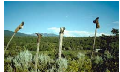
The "Boot Fence," near D.H. Lawrence Ranch, Questa, New Mexico, is an example of a character-defining landscape feature.

A range of issues may need to be addressed when considering how a particular cultural landscape should be treated. This may include the in-kind replacement of declining vegetation, reproduction of furnishings, rehabilitation of structures,