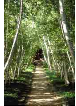
The historic birch allee at Stan Hywet Hall, Akron, Ohio, which had suffered from borer infestation and leaf miner, was preserved through a series of carefully executed steps that took 15 years to realize.

Throughout the preservation planning process, it is important to ensure that existing landscape features are retained. Preservation maintenance is the practice of monitoring and controlling change in the landscape to ensure that its historic integrity is not altered and features are not lost. This is particularly important during the research and long-term treatment planning process. To be effective, the maintenance program must have a guiding philosophy, approach or strategy; an understanding of preservation maintenance techniques; and a system for documenting changes in the landscape.