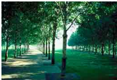
Another example of a very different landscape feature is this tree planting detail for Jefferson Memorial Park, St. Louis, Missouri.

Nearly all designed and vernacular landscapes evolve from, or are often dependent on, natural resources. It is these interconnected systems of land, air and water, vegetation and wildlife which have dynamic qualities that differentiate cultural landscapes from other cultural resources, such as historic structures. Thus, their documentation, treatment, and ongoing management require a comprehensive, multi-disciplinary approach.