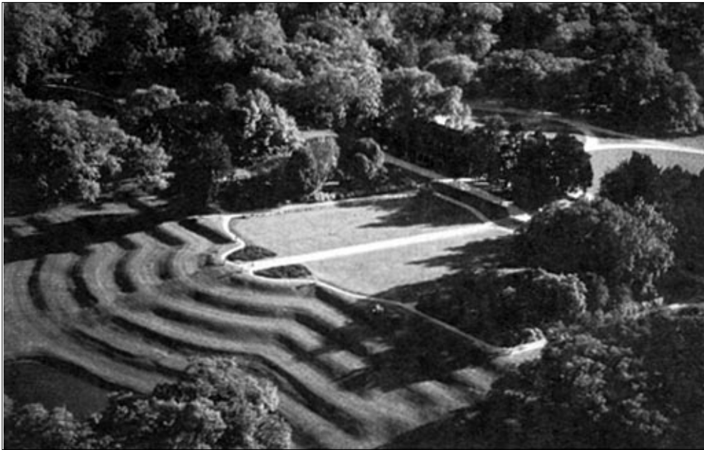
The spacious grounds at Middleton Place, near Charleston, South Carolina, constitute the first landscaped garden in America. The molded terraces, originally constructed in the 18th century, were largely reconstructed in the early 20th century based on extant remains and other documentary evidence.