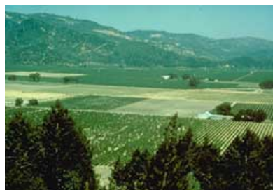
Patterns on the land have been preserved through the continuation of traditional uses, such as the grape fields at the Sterling Vineyards in Calistoga, California.

Cultural landscapes can range from thousands of acres of rural tracts of land to a small homestead with a front yard of less than one acre. Like historic buildings and districts, these special places reveal aspects of our country's origins and development through their form and features and the ways they were used. Cultural landscapes also reveal much about our evolving relationship with the natural world.