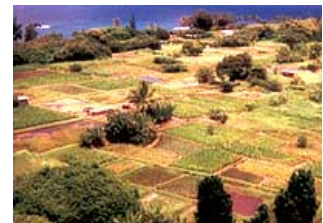
Taro fields in Hanalei, Hawaii.

Cultural landscapes can range from thousands of acres of rural tracts of land to a small homestead with a front yard of less than one acre. Like historic buildings and districts, these special places reveal aspects of our country's origins and development through their form and features and the ways they were used. Cultural landscapes also reveal much about our evolving relationship with the natural world.