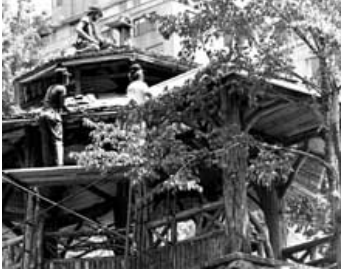
Central Park has developed an in-house historic preservation crew to undertake small projects. A specialized crew has been trained to repair and rebuild rustic furnishings.

The philosophical approach to maintenance should coincide with the landscape's current stage in the preservation planning process. A Cultural Landscape Report and Treatment Plan can take several years to complete, yet during this time managers and property owners will likely need to address immediate issues related to the decline, wear, decay, or damage of landscape features. Therefore, initial maintenance operations may focus on the stabilization and protection of all landscape features to provide temporary, often emergency measures to prevent deterioration, failure, or loss, without altering the site's existing character.