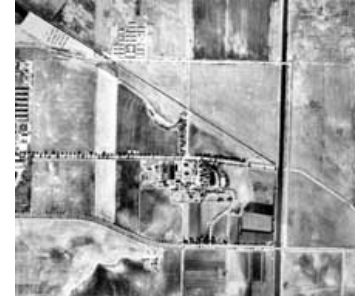
Understanding the geographic context should be part of the inventory process. This aerial photograph at Rancho Los Alamitos, Long Beach, CA, was taken in 1936. (See, below.)

Treating living plant materials as a curatorial collection has also been undertaken at some cultural landscapes. This process, either done manually or by computer, can track the condition and maintenance operations on individual plants. Some sites, such as the Frederick Law Olmsted National Historic Site, in Brookline, Massachusetts have developed a field investigation numbering system to track all woody plants. Due to concern for the preservation of genetic diversity and the need to replace significant plant materials, a number of properties are beginning to propagate historically important rare plants that