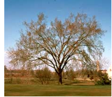
When the American Elm was plagued with Dutch Elm Disease, many historic properties relied on the Japanese Zelkova as a substitute plant (see below).

The overall historic preservation approach and treatment approach can ensure the proper retention, care, and repair of landscapes and their inherent features. In short, the Standards act as a preservation and management tool for cultural landscapes. The four potential treatments are described.