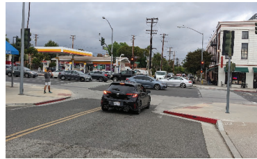
Example of proposed bulb-out trimming locations on the northwest and southwest corners of Fair Oaks Avenue & Hope Street

Bulb-outs exist at 17 corners on Fair Oaks Avenue. Possible improvements include smoothing the curb angles to accommodate street sweeping, trimming the approaches to allow right turn-on-red movements, or potentially the complete removal of the bulb-outs.