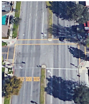
Example of proposed median trimming location at intersection of Fair Oaks Avenue & Banks Street

South of Monterey Road, the Fair Oaks Avenue median noses lie on the left side of the left turn lanes, offsetting the sight alignment of motorists in those lanes. Removing the median noses adjacent to 7 left turn lanes will reduce the lane offset and improve sight distance.