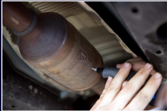
Etch License Plate on Catalytic Converter