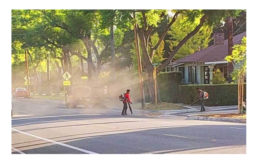
Finally, repeated noise exposure, particularly for the gardeners, is ear damaging without protection. For residents, it regularly disturbs peaceful enjoyment of homes and neighborhoods.