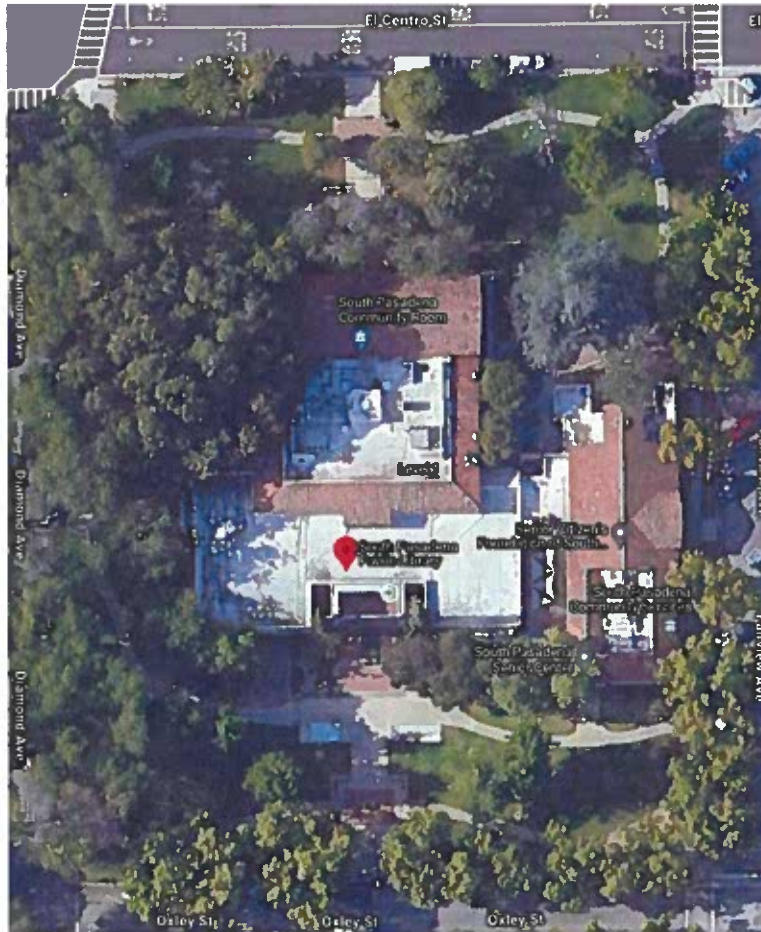
South Pasadena Library, Community Center, Senior Center & Park Facilities

Library, Senior Center and Community Room. The entire site is centrally located in the City, incorporating a block that is inclusive of the Library, Senior Center, Community Center and Park facilities.